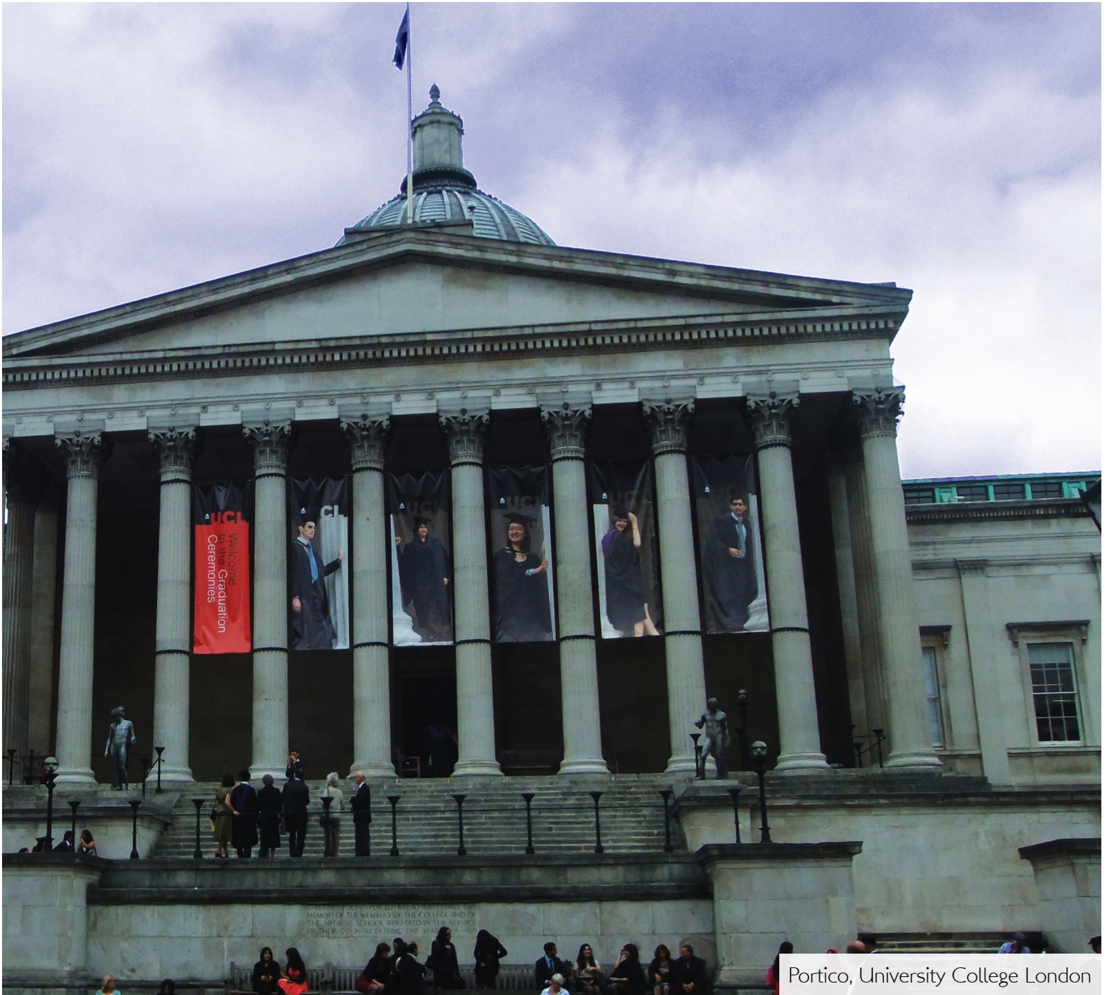
Portico, University College London