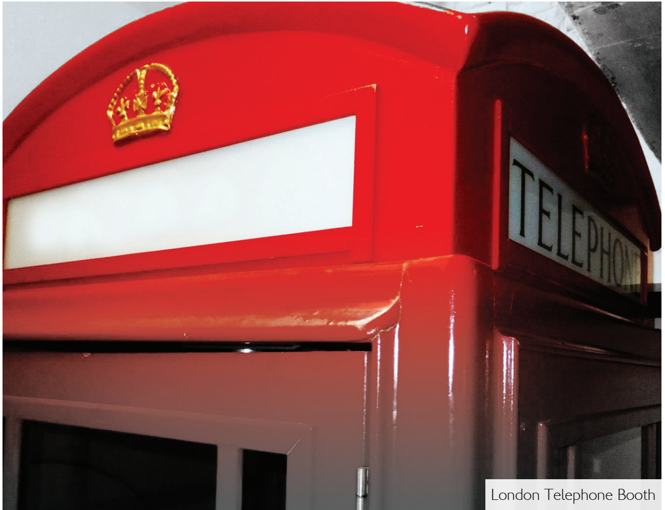
London Telephone Booth

There's a saying that goes "When a man is tired of London, he is tired of life". Indeed, London has a lot to offer when it comes to entertainment. The Soho and Covent Garden districts are very popular haunts, apart from interesting sights at Piccadilly Circus. London is also definitely a shopping haven . You can find the latest trends in fashion in the Knightsbridge and Kensington districts, as well as the world's largest department stores in Harrods.