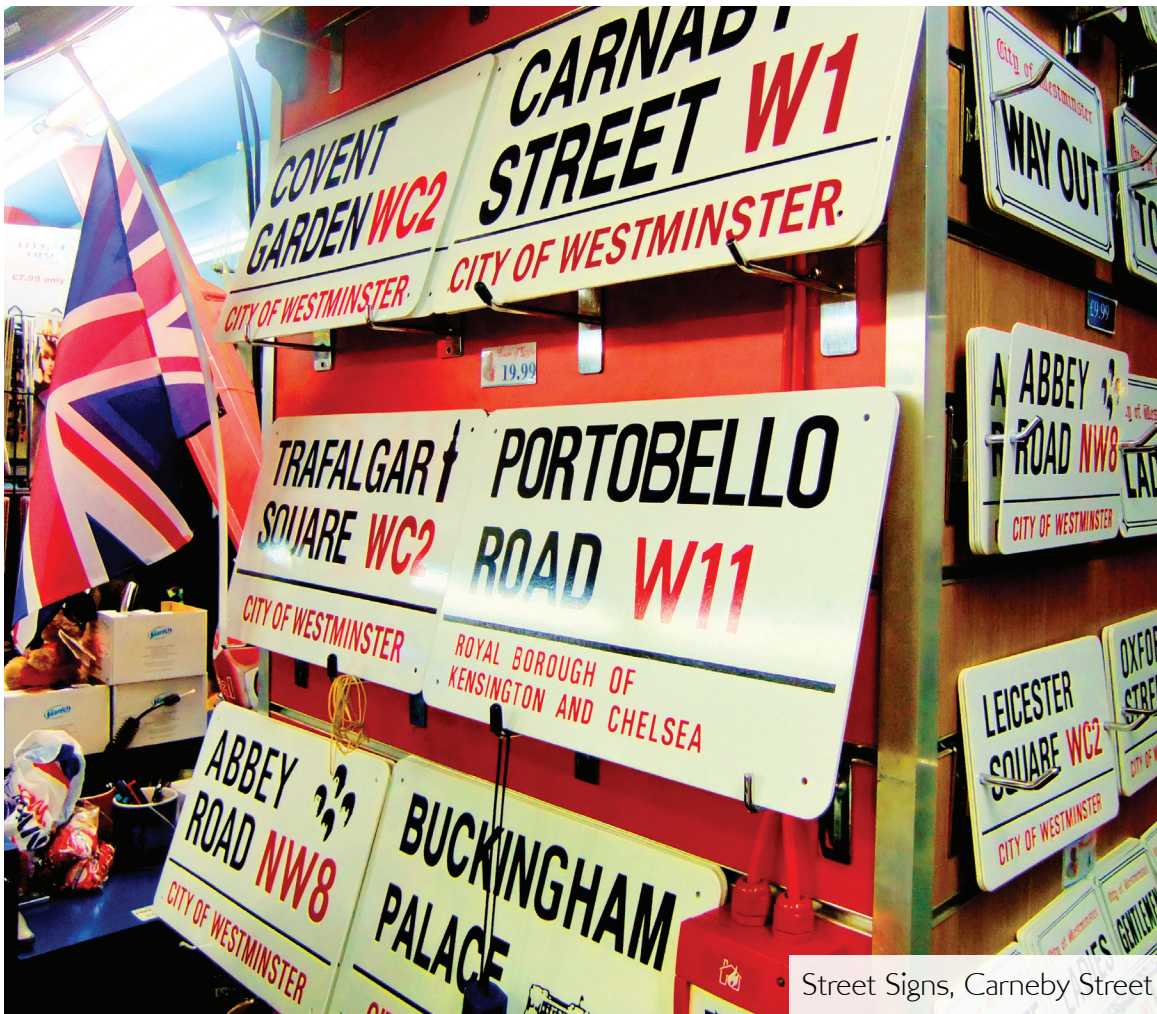
Street Signs, Carneby Street