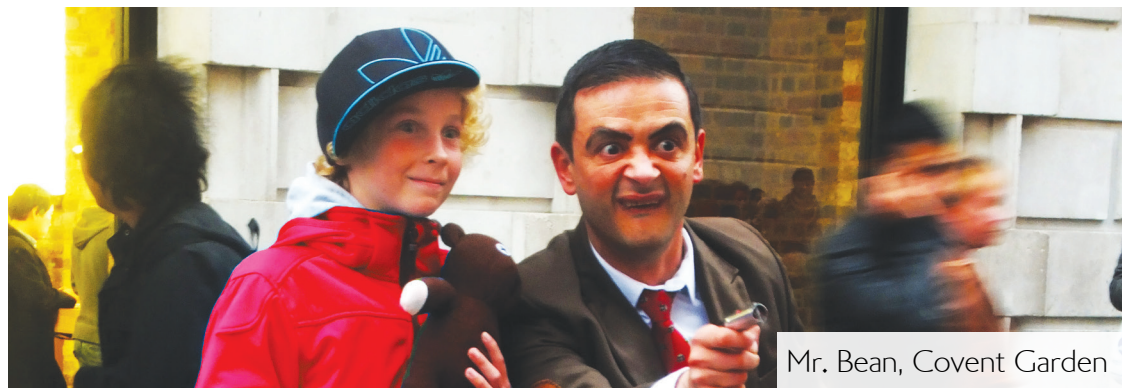
Mr. Bean, Covent Garden