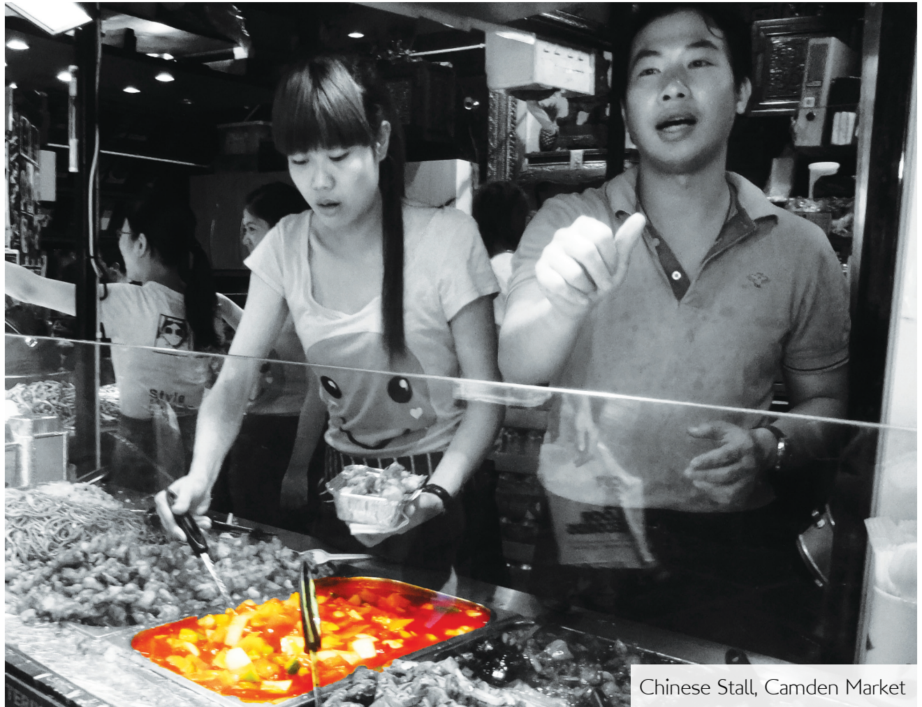
Chinese Stall, Camden Market

London is not only a cosmopolitan city, but also a food paradise . As you roam around the streets of London, it is almost impossible to miss the sights of American, Asian or European restaurants. If you are feeling rich enough, there are also Michelin stars restaurants dining to splurge on. There are also food markets such as the Borough Market - a market that has captured London's rich culinary skills, and offers a rich collection of British and international produce.