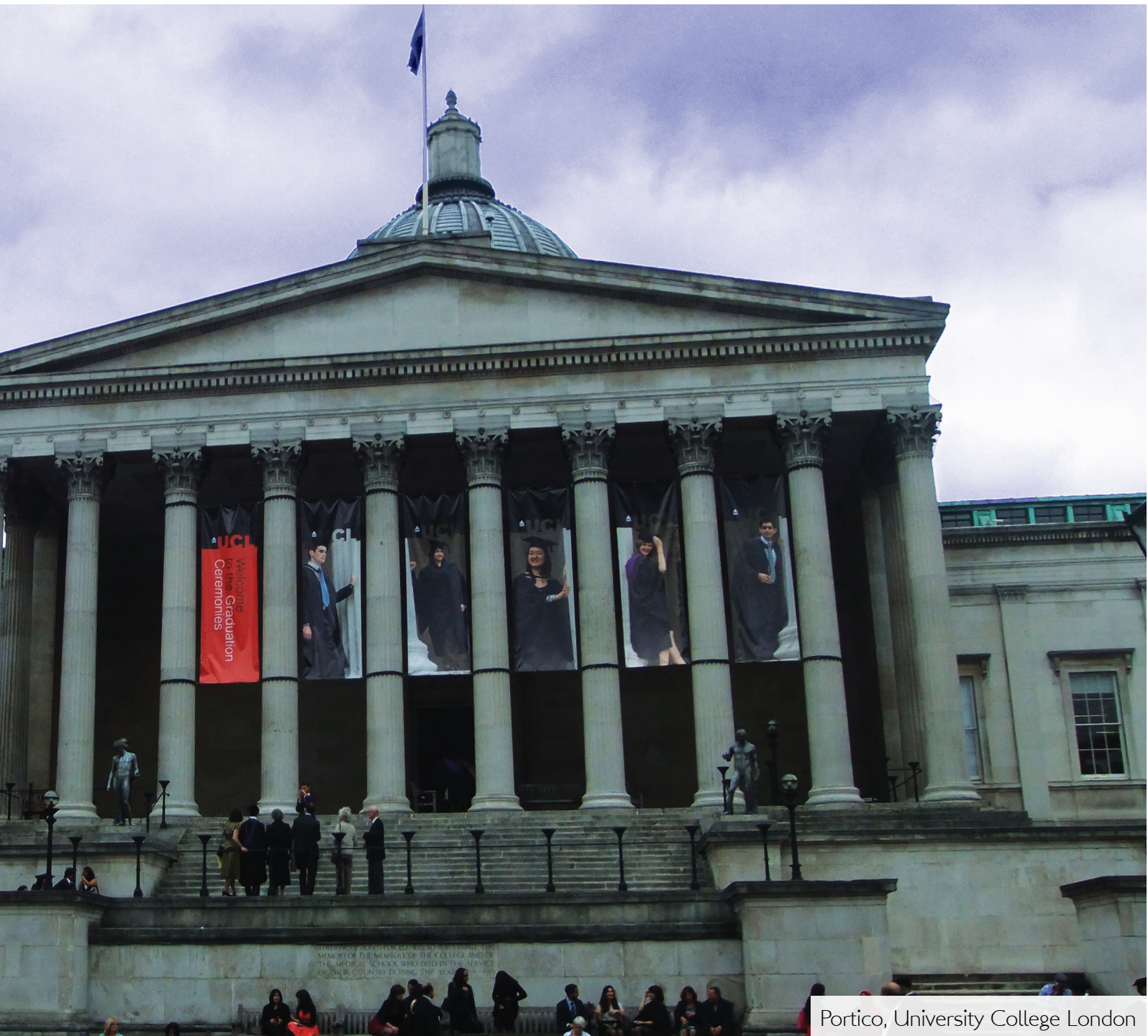
Portico, University College London