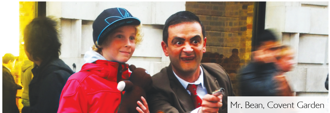
Mr. Bean, Covent Garden