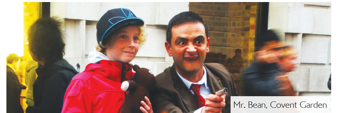
Mr. Bean, Covent Garden

There's a saying that goes "When a man is tired of London, he is tired of life". Indeed, London has a lot to offer when it comes to entertainment. The Soho and Covent Garden districts are very popular haunts, apart from interesting sights at Piccadilly Circus. London is also definitely a shopping haven . You can find the latest trends in fashion in the Knightsbridge and Kensington districts, as well as the world's largest department stores in Harrods.