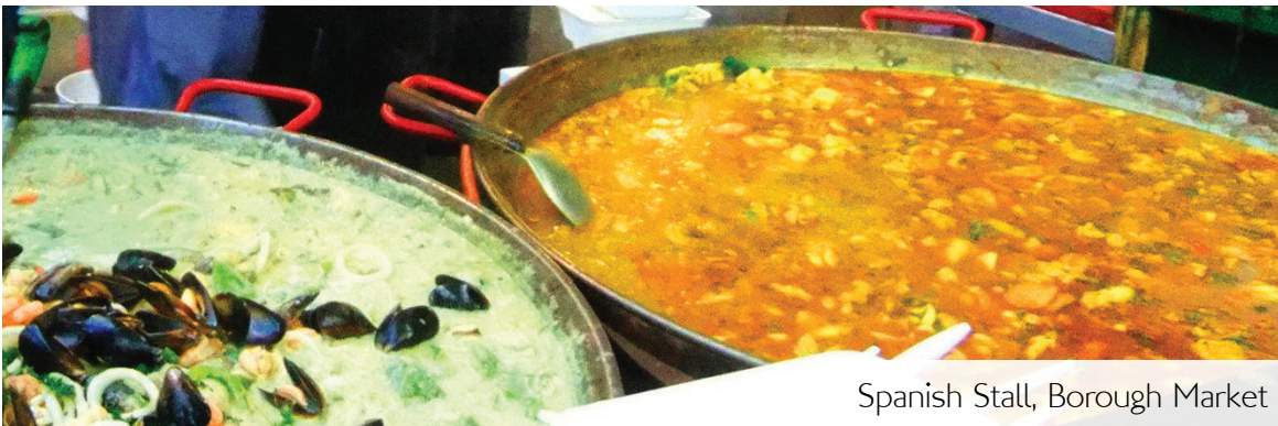
Spanish Stall, Borough Market

London is not only a cosmopolitan city, but also a food paradise . As you roam around the streets of London, it is almost impossible to miss the sights of American, Asian or European restaurants. If you are feeling rich enough, there are also Michelin stars restaurants dining to splurge on. There are also food markets such as the Borough Market - a market that has captured London's rich culinary skills, and offers a rich collection of British and international produce.