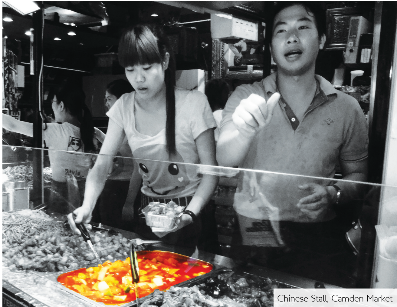
Chinese Stall, Camden Market