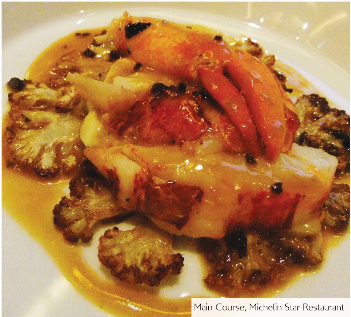
Main Course, Michelin Star Restaurant

London is not only a cosmopolitan city, but also a food paradise . As you roam around the streets of London, it is almost impossible to miss the sights of American, Asian or European restaurants. If you are feeling rich enough, there are also Michelin stars restaurants dining to splurge on. There are also food markets such as the Borough Market - a market that has captured London's rich culinary skills, and offers a rich collection of British and international produce.