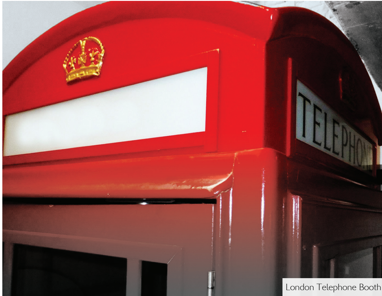
London Telephone Booth