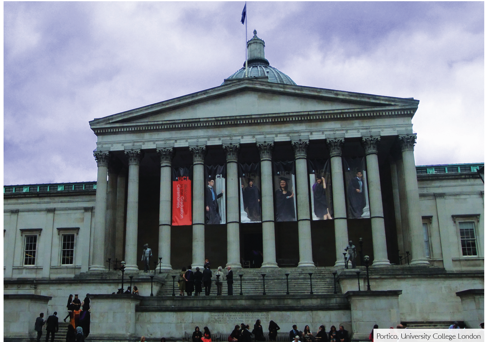
Portico, University College London

London is an awesome city for studying abroad. Top ranking universities include University College London (UCL) where I studied abroad, Imperial College London (ICL), London School of Economics (LSE), King's College London (KCL), and the list goes on. Studying in London provides students with an opportunity to work and play hard . It is easy to balance study and social life, as London has so much to offer.