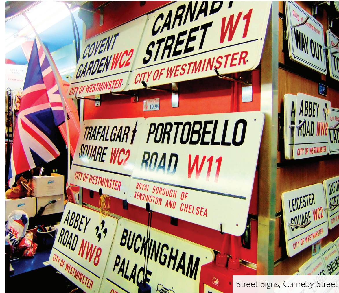
Street Signs, Carney Street

There's a saying that goes "When a man is tired of London, he is tired of life". Indeed, London has a lot to offer when it comes to entertainment. The Soho and Covent Garden districts are very popular haunts, apart from interesting sights at Piccadilly Circus. London is also definitely a shopping haven . You can find the latest trends in fashion in the Knightsbridge and Kensington districts, as well as the world's largest department stores in Harrods.