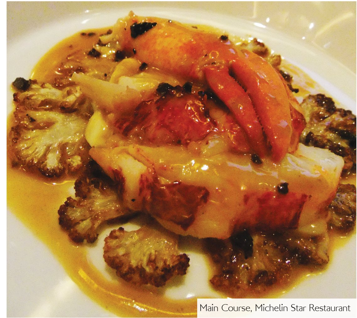
Main Course, Michelin Star Restaurant

London is not only a cosmopolitan city, but also a food paradise . As you roam around the streets of London, it is almost impossible to miss the sights of American, Asian or European restaurants. If you are feeling rich enough, there are also Michelin stars restaurants dining to splurge on. There are also food markets such as the Borough Market - a market that has captured London's rich culinary skills, and offers a rich collection of British and international produce.