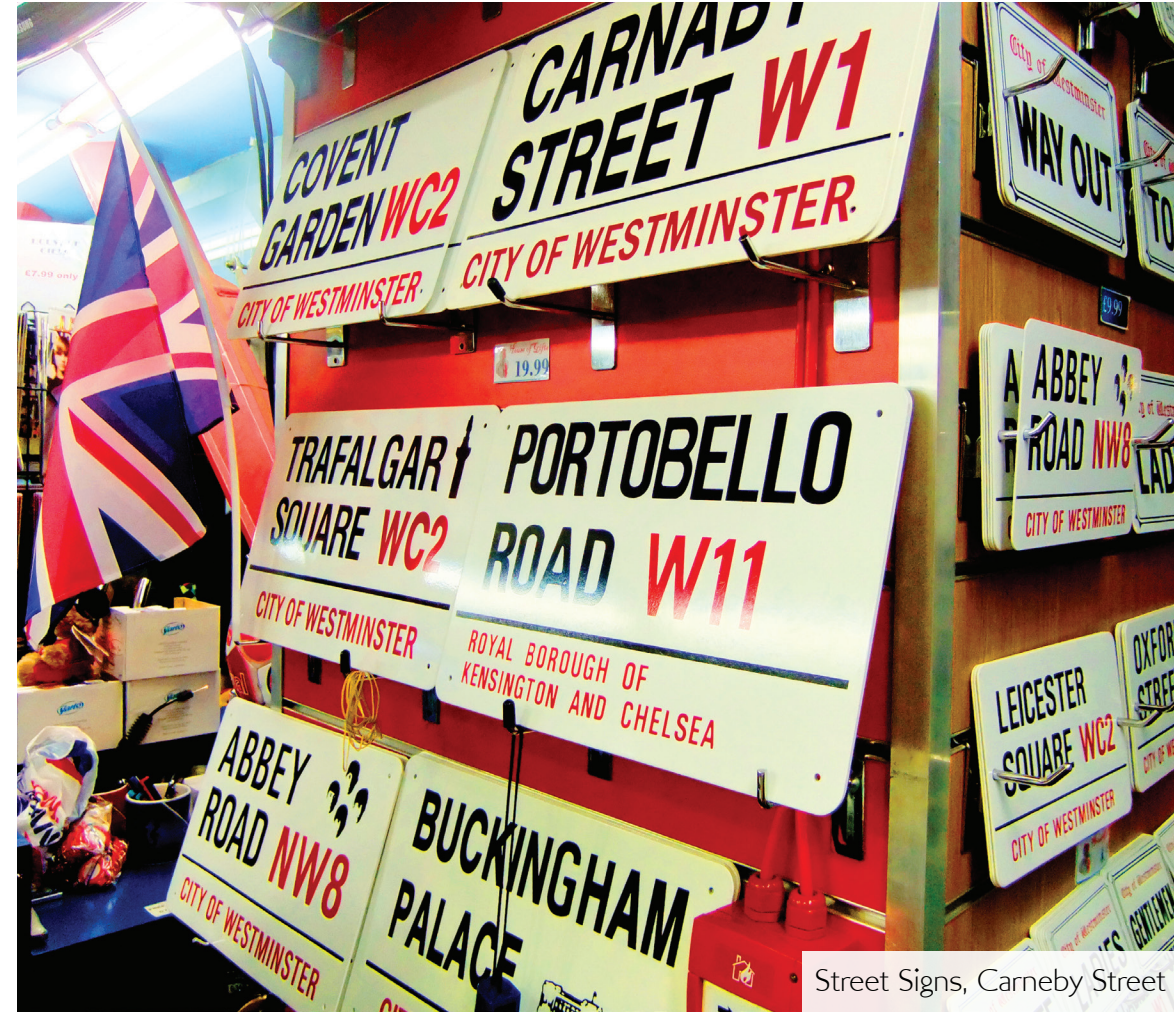
Street Signs, Carneby Street

There's a saying that goes "When a man is tired of London, he is tired of life". Indeed, London has a lot to offer when it comes to entertainment. The Soho and Covent Garden districts are very popular haunts, apart from interesting sights at Piccadilly Circus. London is also definitely a shopping haven . You can find the latest trends in fashion in the Knightsbridge and Kensington districts, as well as the world's largest department stores in Harrods.