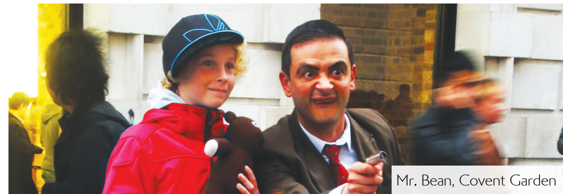
Mr. Bean, Covent Garden

There's a saying that goes "When a man is tired of London, he is tired of life". Indeed, London has a lot to offer when it comes to entertainment. The Soho and Covent Garden districts are very popular haunts, apart from interesting sights at Piccadilly Circus. London is also definitely a shopping haven . You can find the latest trends in fashion in the Knightsbridge and Kensington districts, as well as the world's largest department stores in Harrods.