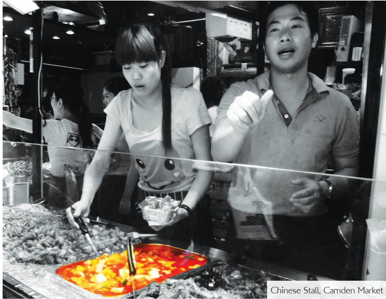
Chinese Stall, Camden Market