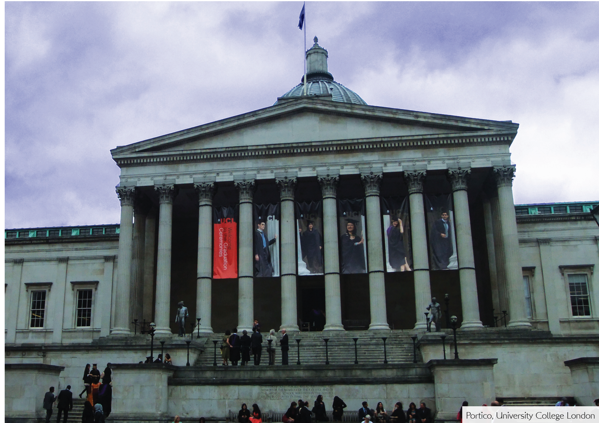
Portico, University College London

London is an awesome city for studying abroad. Top ranking universities include University College London (UCL) where I studied abroad, Imperial College London (ICL), London School of Economics (LSE), King's College London (KCL), and the list goes on. Studying in London provides students with an opportunity to work and play hard . It is easy to balance study and social life, as London has so much to offer.